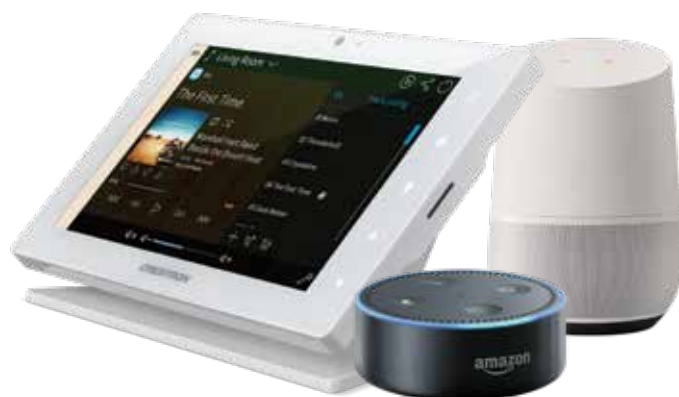
Amazon® Dot, Google® Home and Crestron 7" Touch Screen with tabletop kit

Crestron technology blends artfully into the background, but it's always ready to respond to your needs. You can dim the lights, lower your gorgeous shades and turn up the music with your Crestron TSR-310 handheld remote, or take command of your system with your voice using Amazon Alexa. We take voice control to an awe-inspiring new level no other company can match; easily activate pre-set scenes, adjust settings to specific levels, or say more general commands like "I'm cold" or "It's too dark" to have your Crestron system raise the temperature or turn up the lights. Whatever you need, just say the word with Crestron.