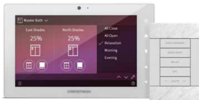
7" Touch Screen and Horizon keypad

Crestron motorized shades and drapery systems transform any room into a more spectacular space. Our stunning designer fabrics, elegant hardware, and world-class technology ensure you find the perfect shading solution for every space in your home. We can even make shades that complement your design scheme perfectly with our exclusive Colour Match service for shades. On top of all that, our limited lifetime warranty ensures your beautiful Crestron shades work flawlessly for as long as you own your home.