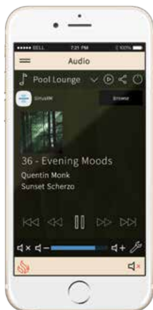
Crestron Pyng® app for iOS

Turn your personal oasis into a true paradise with Crestron control that anticipates your every want and need. As the sun sets, the pool lights turn on automatically and the landscape lighting gradually ramps up. With your waterproof Crestron remote you can change the channel on your outdoor TV, choose your favourite playlist or adjust the jets in your hot tub while enjoying a well deserved soak. With Crestron managing the great outdoors you now know that complete and unparalleled control inside and out is yours.