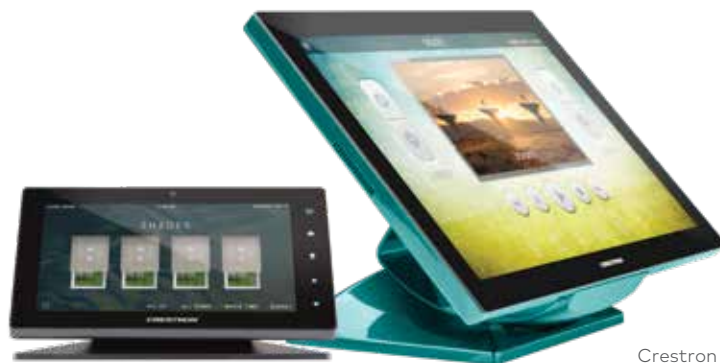
7" Touch Screen with tabletop kit

Not only does everything look great, we make it easy to create custom scenes and schedules that orchestrate your lights, shades, music, video, security, temperature and other technology exactly to your taste. No other company compares to Crestron when it comes to delivering a personalized home automation experience that reflects your one-of-a-kind lifestyle.