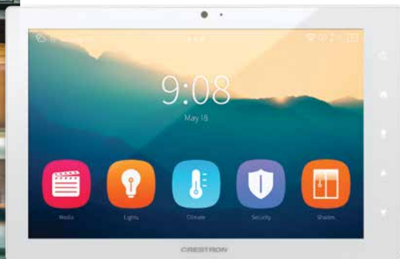
Wall-mount 10" Touch Screen

Explore the following pages for inspiration to create your perfect Crestron Home!